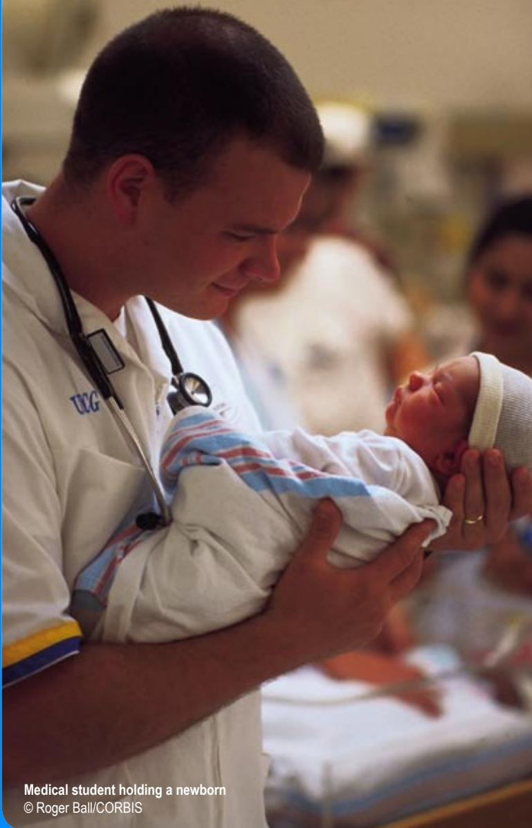
Medical student holding a newborn