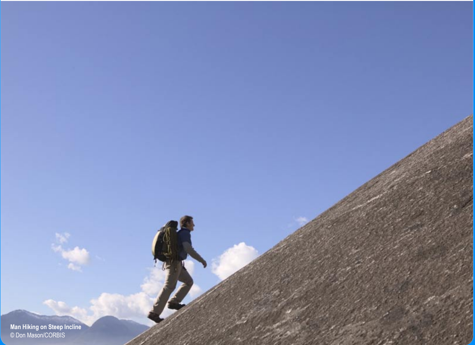
Man Hiking on Steep Incline