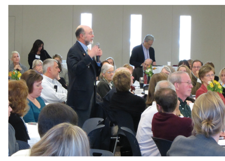
Evaluations show attendees over 94% satisfied with the conference content and speakers.

United Health Group, Compassion & Choices, Medica, the American Cancer Society, Mayo Clinic, Park Nicollet, Mid-Minnesota Legal Aid, Abbott Northwestern, the Food and Drug Administration, Fairview Health Services, the Minnesota House of Representatives, North Memorial Hospital, Sanford Health, the Hennepin County Medical Center, the Minnesota Department of Human Services, and the Minnesota Attorney General's Office.