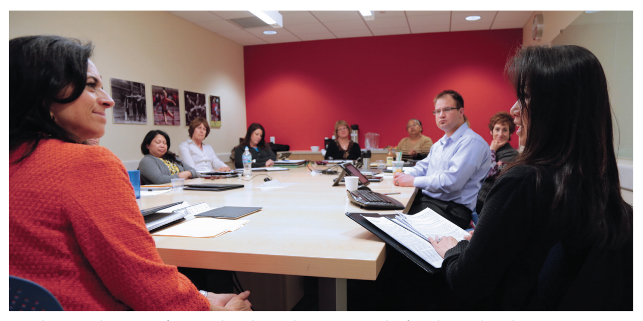
Online Compliance Certificate students began their program with a four-day residential component on Hamline's Saint Paul campus, and it culminated with students reuniting for a two-day capstone experience that included a comprehensive, multifaceted simulation exercise to test operational and substantive concepts learned throughout the program.